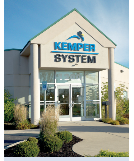
West Seneca, USA A KEMPER branch since 1991. 55 employees. Most popular product: KEMPEROL 2K-PUR.

Vellmar, Germany KEMPER headquarters since 1957. 120 employees.