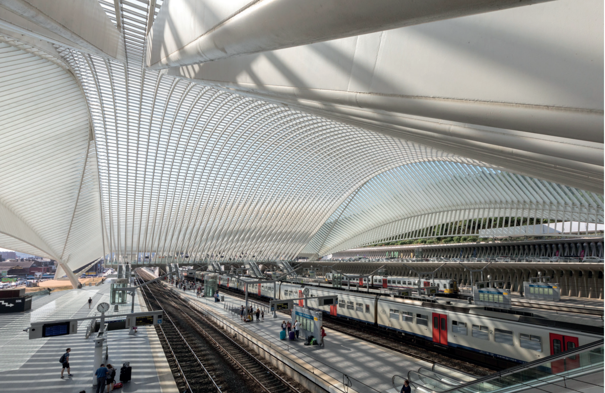
Liège-Guillemins railway station in Liège, Belgium

In the future, Mr. Luis will be relying particularly on the new product generation with KEMPEROL 2K-PUR, which he regards as ideal for refurbishing the many In Belgium and Luxembourg, KEMPEROL green roofs that are found throughout has been used to waterproof a total sur- Belgium and Luxembourg. KEMPER face area of 850,000 m<sup>2</sup> over the past 30 + SYSTEM looks forward to many more years of successful cooperation with