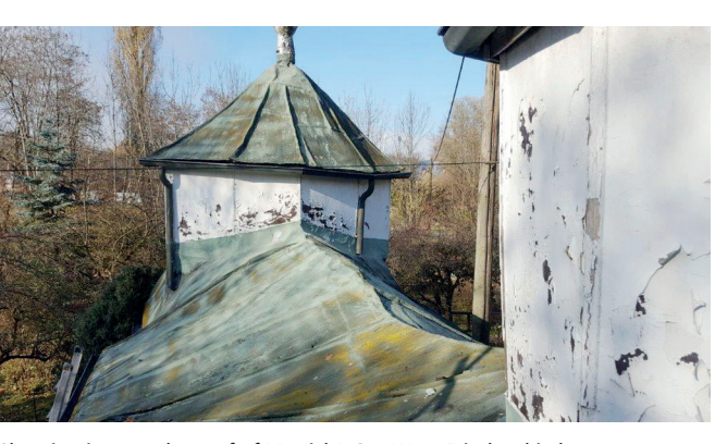
Showing its age: the roof of Munich's Ost-West-Friedenskirche.