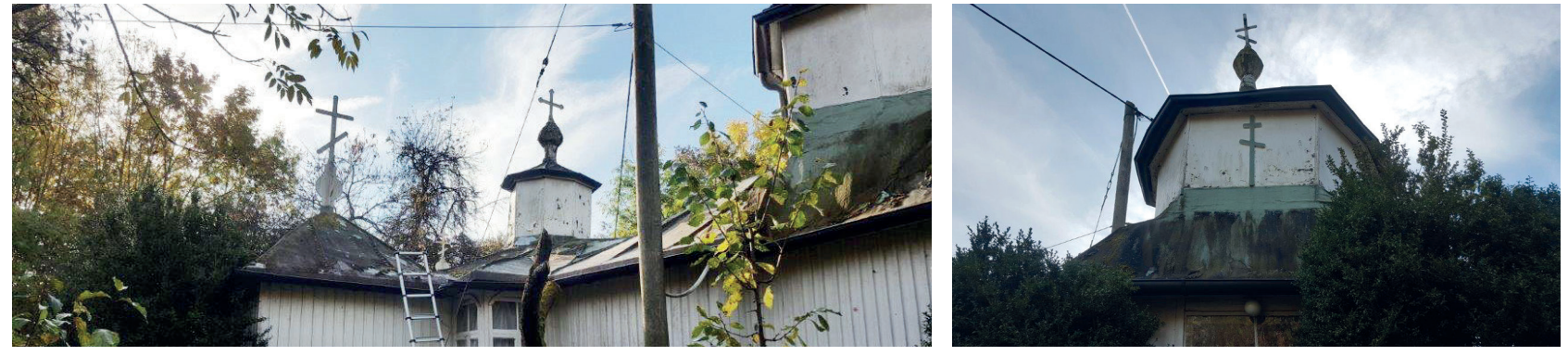
The "most charming illegally built structures in Munich". After many decades, the metal roofs of the Ost-West-Friedenskirche were in need of repair.

The metal roofs to church and chapel were waterproofed anew with KEMPEROL 2K-PUR in the spring of 2018 by KEMPEROL partner Richard Köhler + Sohn Nachfolger GmbH. Leaks had been noticed, primarily around the junctions with the timber towers. Hans-Jürgen Hartl and his team removed the old waterproofing (a liquid polymer with paint finish) and primed the entire roof surface with KEMPERTEC EP5 before applying the odourless KEMPEROL 2K-PUR Waterproofing System. In order to retain the silvery blue look of the old roof, after curing, the KEMPEROL surface was given a coat of KEMPERDUR PU 2K in an appropriate custom colour.