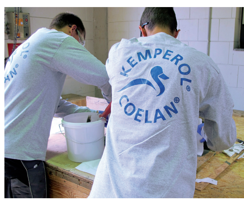
Applying our products properly is crucial for successful waterproofing. Therefore, we pride our selves on the training we provide for roofing apprentices.

It is not only our products that make a big difference to this sector, but also the way we pass on our knowledge to the next generation. In particular, roofing apprentices in their first year can take part in our training courses for liquid polymer waterproofing at the regional training centre for the roofing trade at Bad Schlema in Saxony (https://lbz-sachsen.de). Therefore, every training year, almost 100 young trainees benefit from this concentration of skills. Our qualified KEMPEROL specialists teach them how to waterproof junctions, details, mixed conventional/liquid waterproofed surfaces, etc. The morning of each training day is devoted to theory, the afternoon to the practical application of KEMPEROL 2K-PUR to various models. KEMPER SYSTEM has been offering these training courses for many years as a contribution to sound training measures for the next generation of roofers.